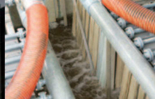
POREFLON™ modules purifying wastewater. Particularly effective for water treatment at petrochemical plants.