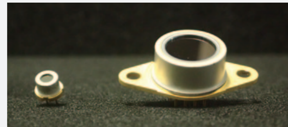
QCL CAN module (Left: without built-in thermoelectric cooler (Φ5.6 mm), Right: with built-in thermoelectric cooler (Φ15.4 mm))

As this module can achieve sufficient light output with low power consumption and low heat emission, it does not require a large and expensive heat dissipation package. This module can also detect gases with high sensitivity in a temperature environment higher than that for