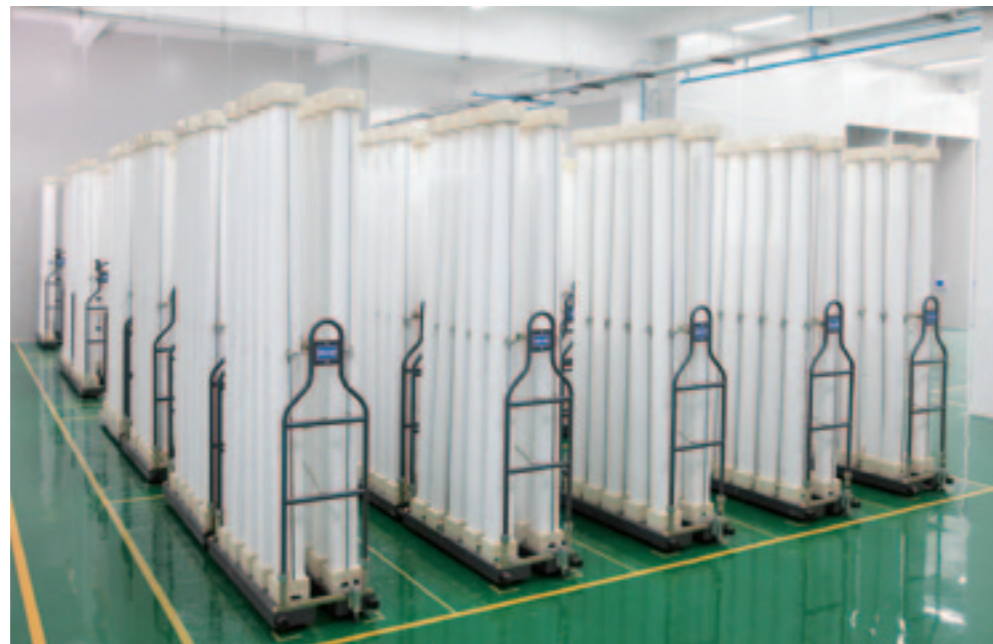
POREFLON™ modules lined up to be shipped from here to worldwide destinations

“We have already started our efforts to maintain the stability of the operation, despite the increase in the number of models. In addition,