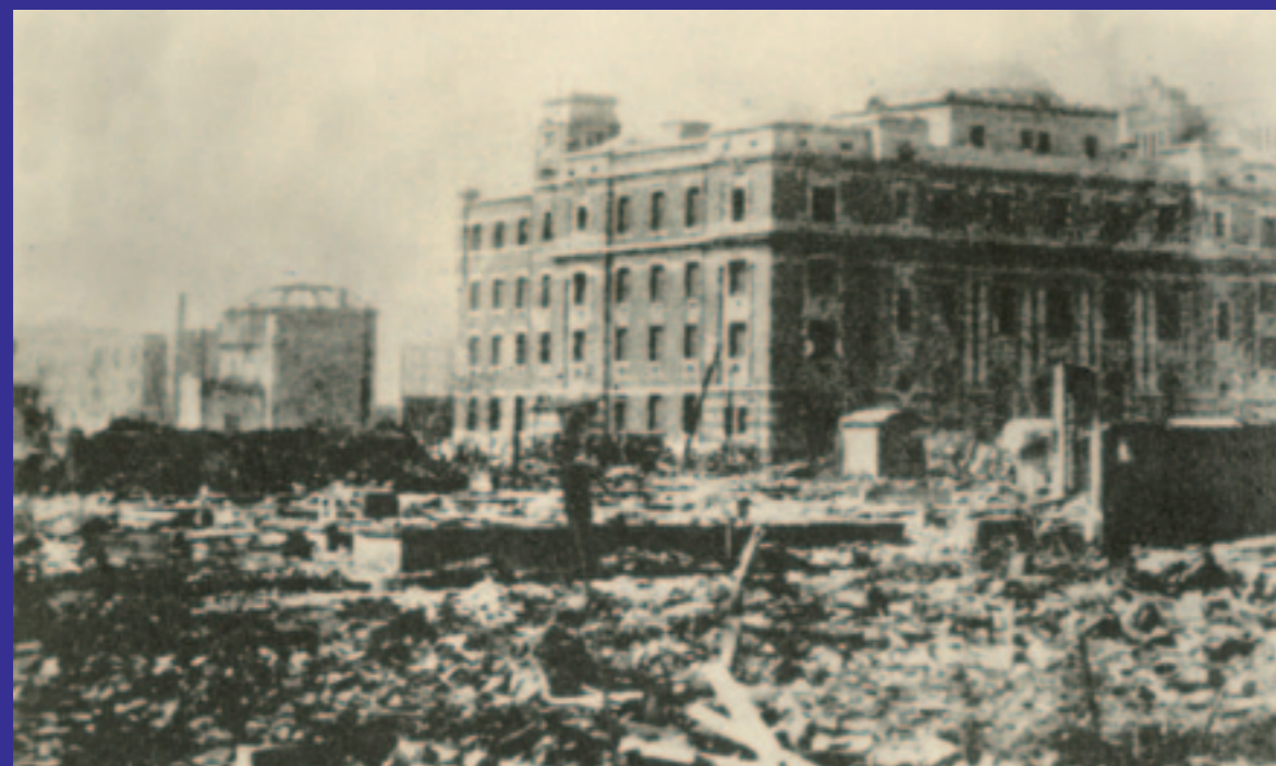
The building housing our Tokyo sales office at the time nearly escaped the fire