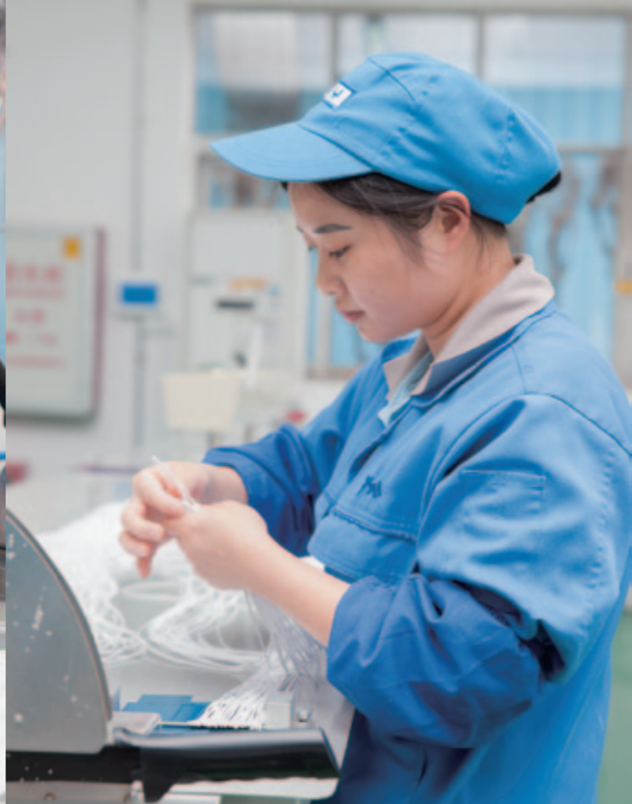
Skilled employees working diligently