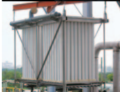
POREFLON™ modules installed in MBR

commercialize POREFLON™ modules for water treatment use.”