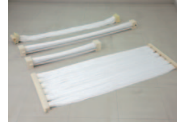
A wide range of POREFLON™ modules usable at various water treatment facilities

as Thailand, Vietnam, and Indonesia, are introducing more stringent regulations and values for effluent water quality, which provides a great business opportunity for membrane manufacturers. We will implement the strategy of detecting the trend of water treatment needs on a timely basis and also building partnership relationships to ensure the receipt of orders, thus actively cultivating new markets.