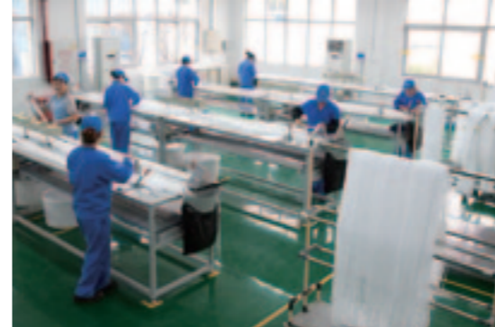
View of the factory of ZSH, a major manufacturing factory of POREFLON™ modules