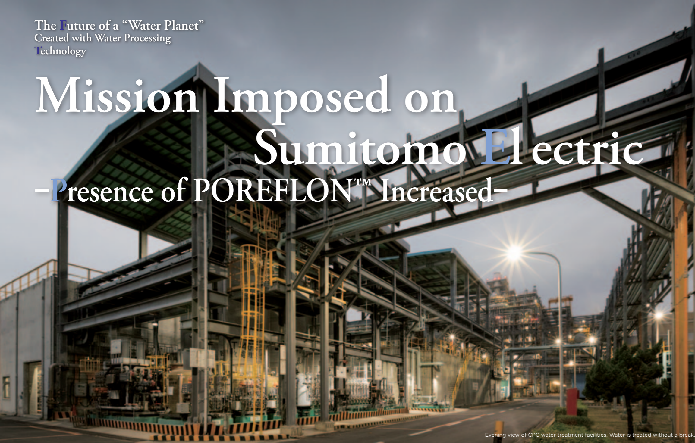
Evening view of CPC water treatment facilities. Water is treated without a break.