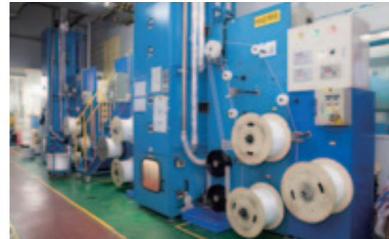
Top-Bottom) Hollow fiber membrane processing equipment operating in the factory