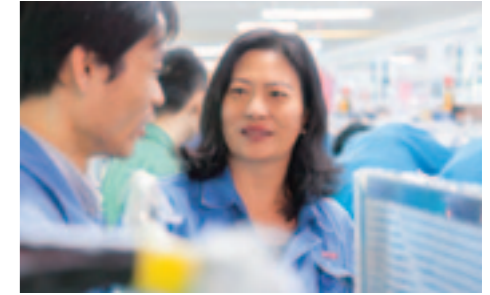
Ensuring communication every day with staffers at work

I first set numerical targets, and advanced the necessary reforms to accomplish the targets. Outside the company, I actively engaged in negotiations with customers to receive their orders, while implementing a wide variety of efforts inside the company such as spreading new principles among staffers with long-term careers and gaining their understanding, reviewing various evaluation systems and regulations, and upgrading facilities and equipment. The most critical element was ensuring unity