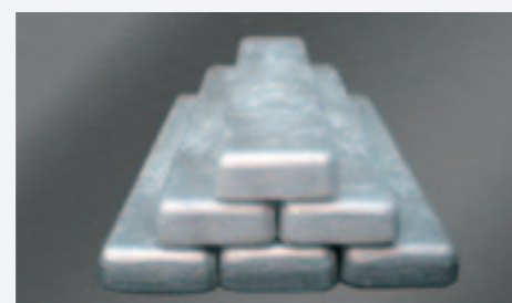
Magnesium alloy ingots for die casting

*A casting process in which a molten metal is injected into a die under high pressure and cooled and solidified. Thanks to its high productivity, die casting is widely used for manufacturing aluminum automotive components.