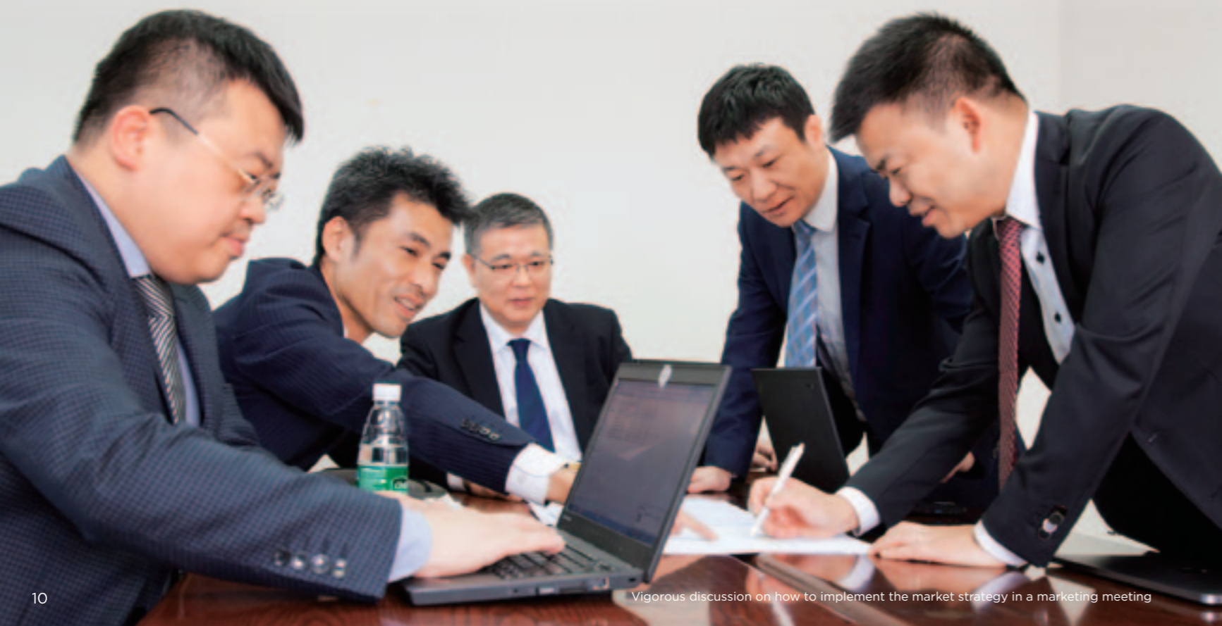
Vigorous discussion on how to implement the market strategy in a marketing meeting

Following East Asia, we are targeting Southeast Asia, as well as North America, to expand our sales. Now, various Southeast Asian countries with significant economic growth, such