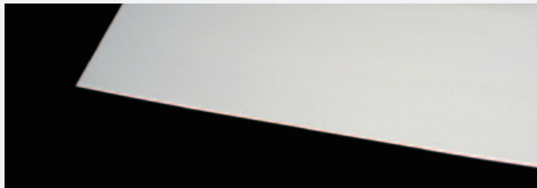
Magnesium Alloy Sheet

Magnesium alloy is the lightest among structural metals. Its specific gravity is about a quarter of that of steel and two thirds of aluminum. Magnesium alloy is recently receiving considerable attention for use as a structural material by taking advantage of its light weight because its disadvantages, such as being "easy to break and hard to process," "prone to corrosion," and "easy to burn," have been overcome. The magnesium alloy most widely used now in the world is "AZ91." This is a material with aluminum and zinc added in amounts of about 9% and 1%, respectively, to increase mechanical strength and enhance corrosion resistance. Sumitomo Electric was the first to successfully develop AZ91 plate metal that can be cut and bent as well as pressed to form the desired shape and started the commercial production of notebook PC chassis using AZ91 plate metal in 2012. Now, we are endeavoring to use this material not only for electronics-related products but also in the automotive, railroad, and aircraft industries, where the weight of components needs to be reduced.