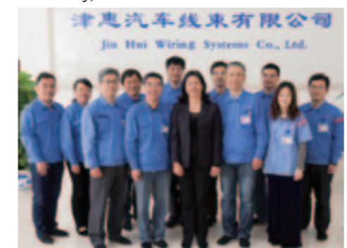
Together with JHWS staff making concerted efforts for the reforms

Five years after the new company's establishment, when I was in charge of financial affairs, a big problem occurred. One of our customers launched mass-production of a new car model, followed by the start of our shipment to the company. Nevertheless, our price negotiation did not reach an agreement, preventing us from recovering our invested capital. We were forced into an extremely difficult financial situation. Being in charge of financial affairs, I thoroughly managed a financial plan and the needed financing on a daily basis, while applying for bank loans, negotiating with the customer on recovering the invested capital, and coordinating with the parent company. I was literally running around everywhere every day. Eventually, our company was able to overcome the big crisis. Facing the difficulty, I considered what I needed