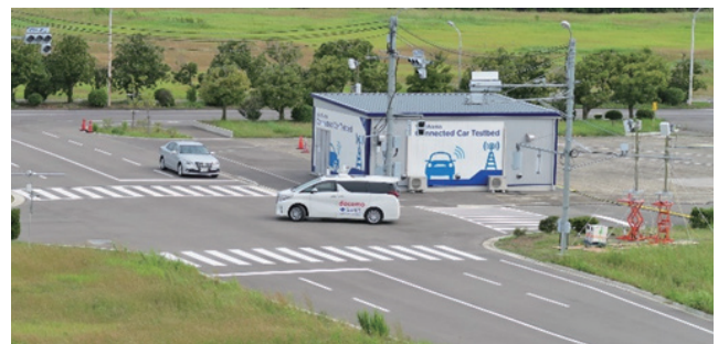
Photo 1. Test bed at Yokohama Works, Sumitomo Electric

Additionally, in September 2017, to promote the realization of advanced driving assist systems, Sumitomo Electric and NTT Docomo Inc. commenced a field test for collection and analysis of road traffic information at real time, using a 5th generation mobile communication system (5G) and sensors incorporated in automobiles and road traffic infrastructure including roads and buildings (Photo 1).