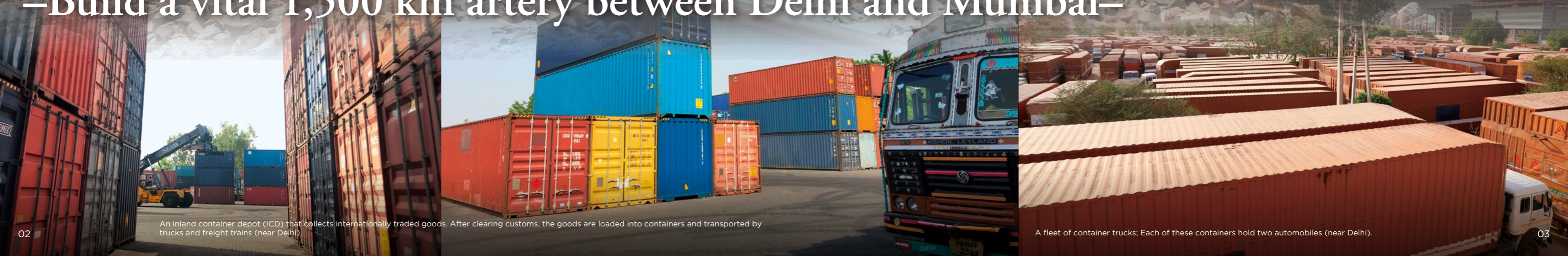
An inland container depot (ICD) that collects internationally traded goods. After clearing customs, the goods are loaded into containers and transported by trucks and freight trains (near Delhi).

—Build a vital 1,500 km artery between Delhi and Mumbai—