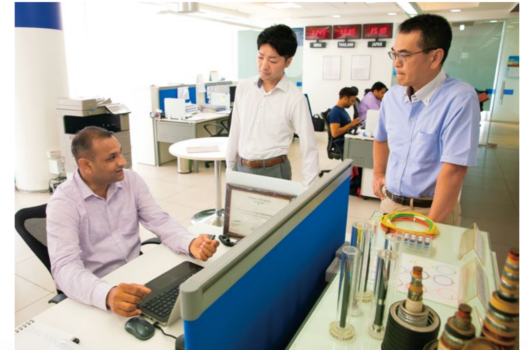
Sales staff promoting Sumitomo Electric's railroad business already at work on next projects