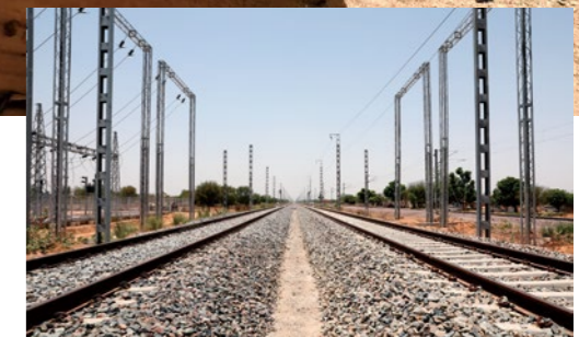
Orderly rows of poles are erected alongside rails before installing contact wires on the railroad

In a STEP project, Japanese companies in the same trade will be competing with us. The Energy Solution Sales Division in close cooperation with the local Indian affiliate strived to win the order.