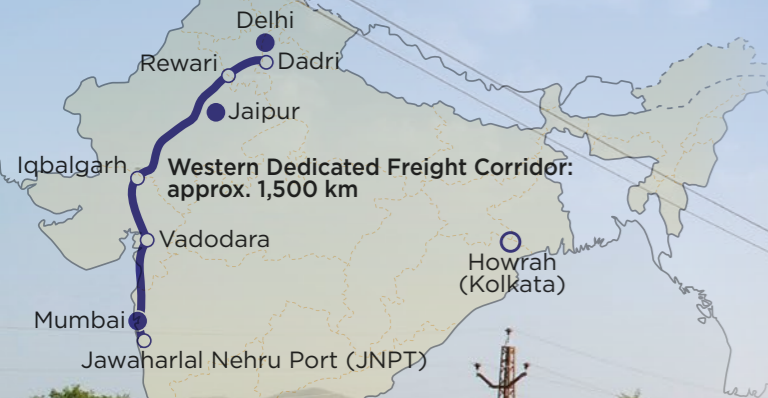
Western Dedicated Freight Corridor with contact wires installed (near Jaipur)