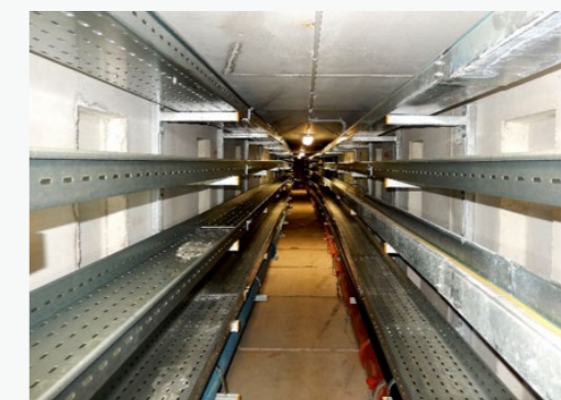
MCF-equipped underground tunnel in city of L'Aquila