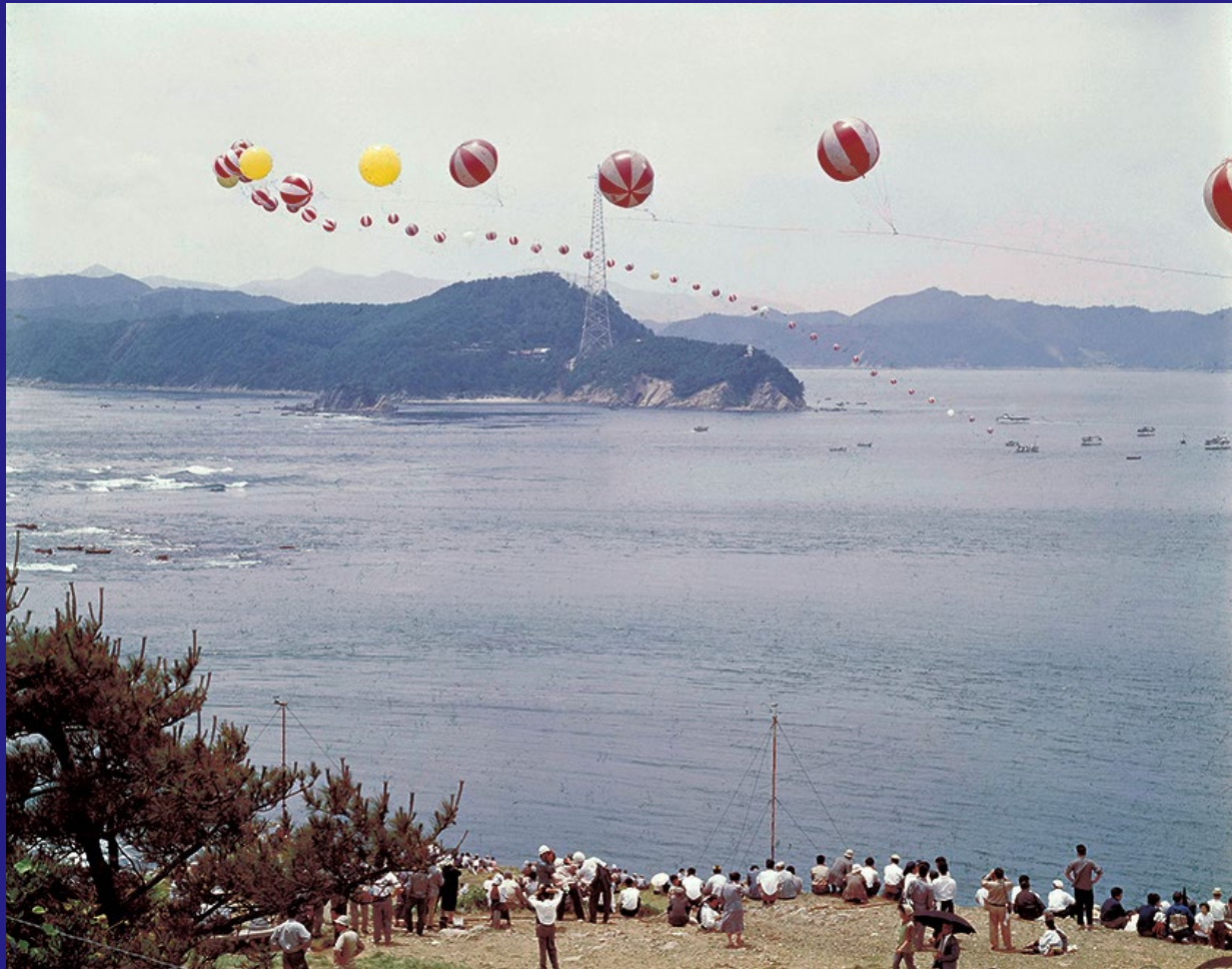
Laying a power transmission line to the opposite bank using balloons