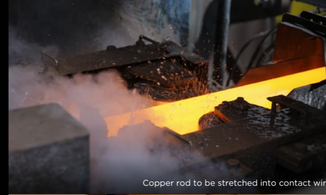
Copper rod to be stretched into contact wire

–Contact wires delivered through strong collaboration between sales and engineering staff–