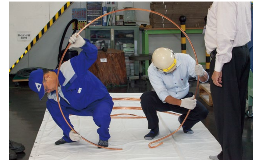
Contact wires destined for India undergo strict quality examination by an independent body every time they are shipped.