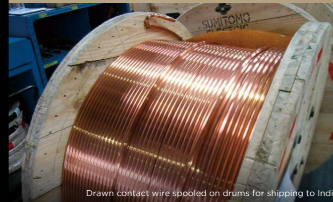
Drawn contact wire spooled on drums for shipping to India