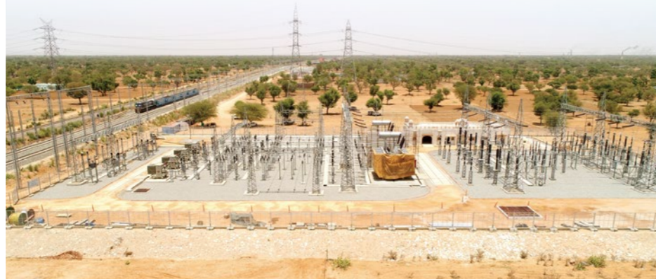
Substation built in a desert beside a railroad; To ensure stable power supply, substations are built equidistantly within a total distance of 1,500 km.