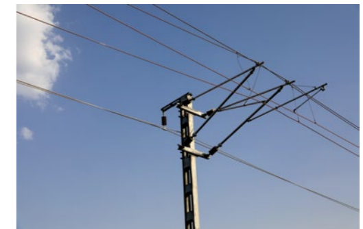
Wires and a pole supporting them to electrify the railroad